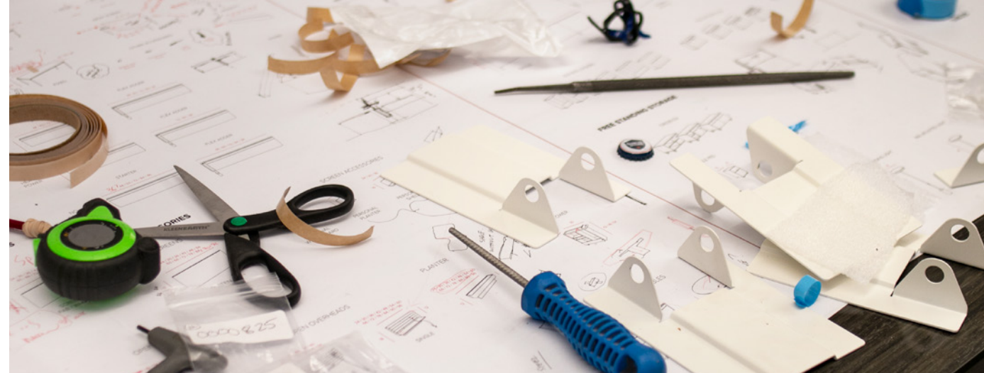
Bracket study for power rail components